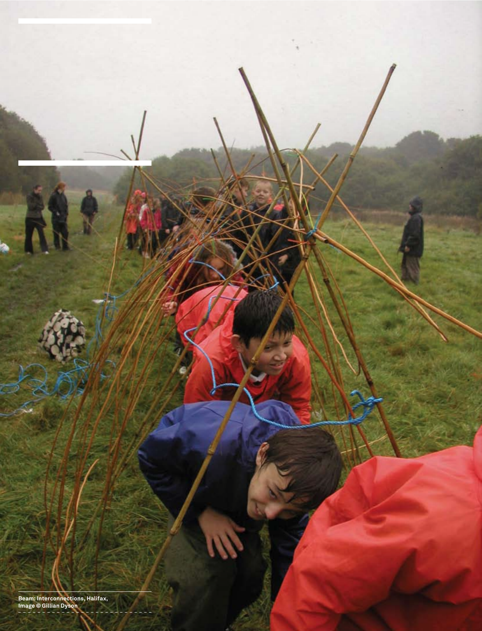
Beam: Interconnections, Halifax